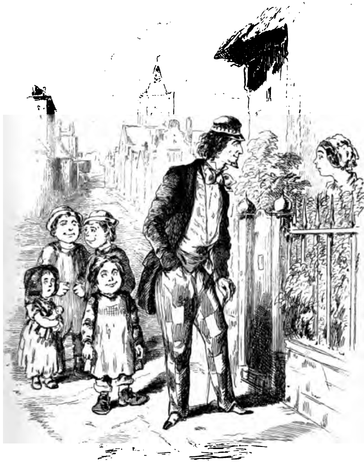
MIROBOLANT FASCINATES THE NATIVES